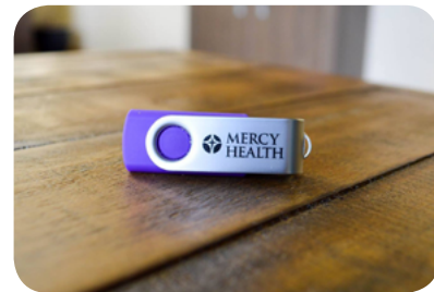
Sponsor flash drives pre-loaded with event presentations