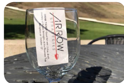
Sponsor drink tickets for evening reception