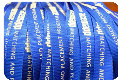
Sponsor lanyards for name tags