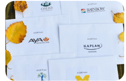
Sponsor gift cards are distributed during the event as attendee raffle prizes