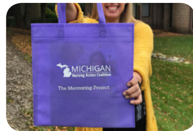
Sponsor tote bags for registration materials