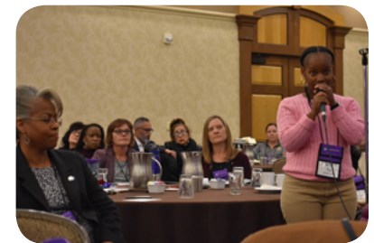
Sponsor a scholarship for a Michigan nursing student