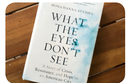
Custom gift sponsorship distributed to all attendees at registration