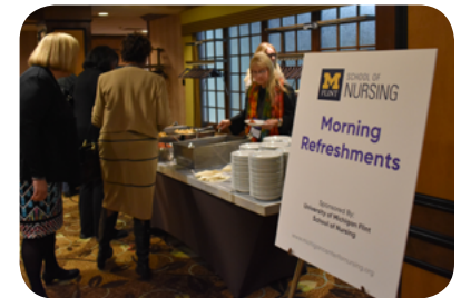
Signage is provided for meal, snack, and keynote sponsors